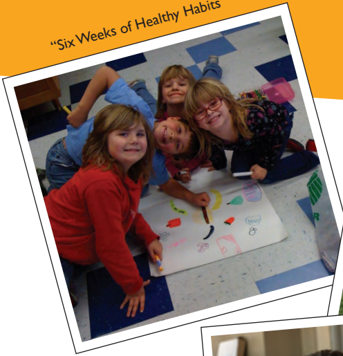
“Six Weeks of Healthy Habits”