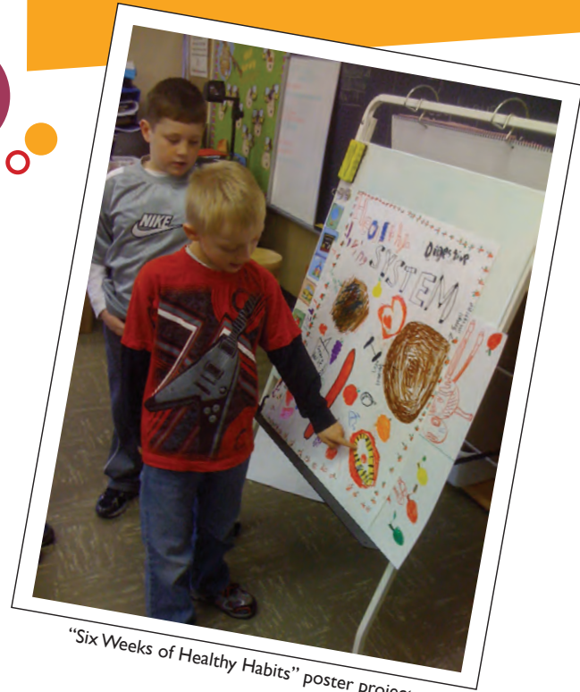
"Six Weeks of Healthy Habits" poster project

We have made every effort to ensure the accuracy of our donor list. If you discover an error, please accept our sincere apologies and notify us at 610.258.8500 extension 18 so we may correct our records. Thank you!