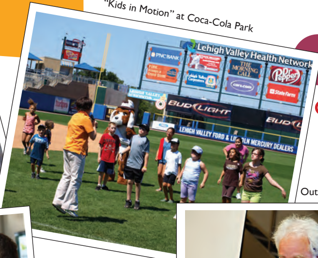
“Kids in Motion” at Coca-Cola Park